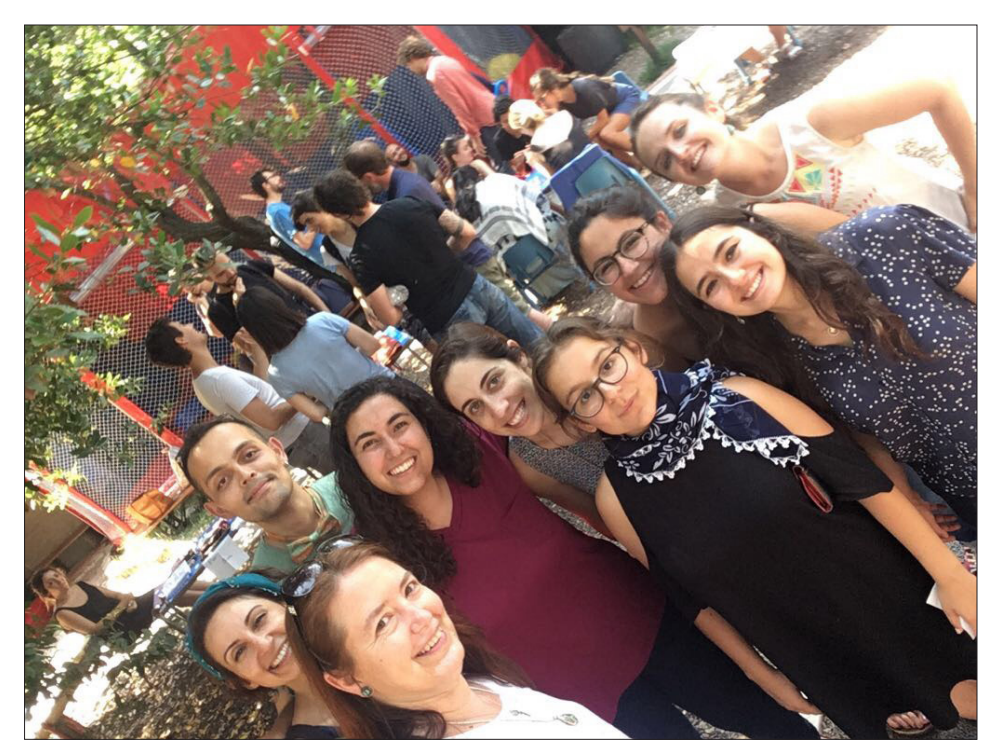
ARIT language program participants and director, summer 2017.