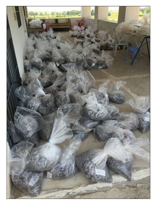
Botanical samples awaiting flotation processing at Kerkenes.