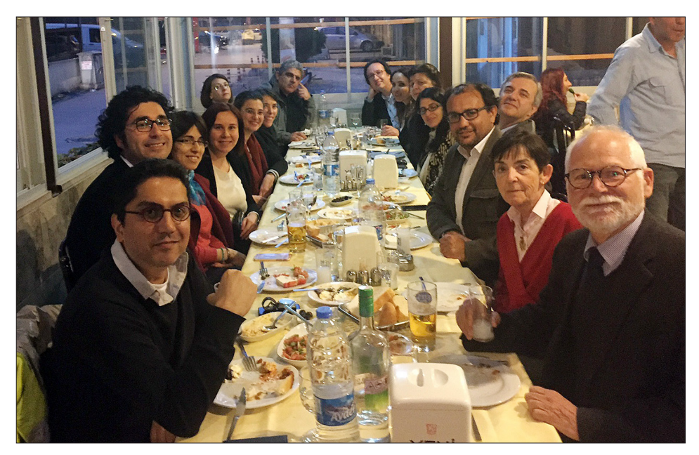
Hanfmann-Mellink Symposium meyhane.

hosted by Istanbul University's Archaeology Department in the spring of 2018.