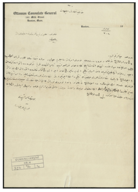
Memorandum from the Ottoman Consulate General in Boston, 1913

While devoting the bulk of my research to my second book project, I also benefitted from time away from my normal teaching and professional duties at Brown to complete my first book, Afghanistan Rising: Islamic Law and Statecraft between the Ottoman and British Empires , published by Harvard University Press in Fall 2017.