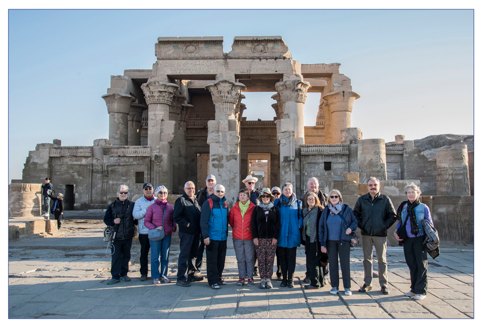
The Friends of ARIT in Egypt.