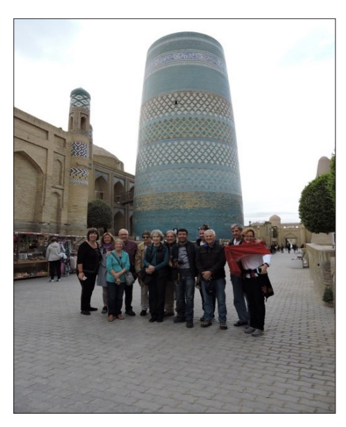
The Friends of ARIT in Uzbekistan.