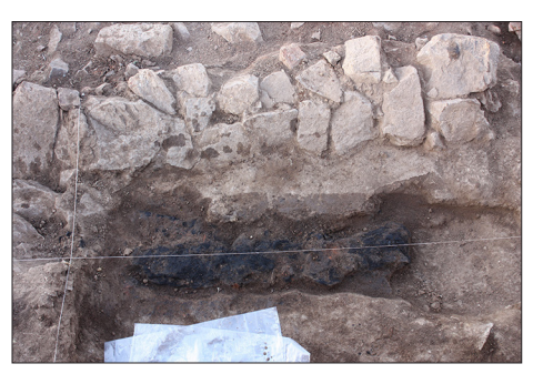
Burned beam from building collapse at Kerkenes; such finds were recovered intact and allow identification of construction practices.