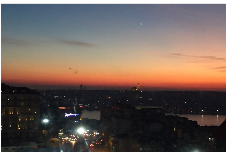
The view from Kallavi Sokak.

Perhaps the hardest part of this process was to accept that we could not afford to run a hostel any longer. Over the years the hostel has often been cited