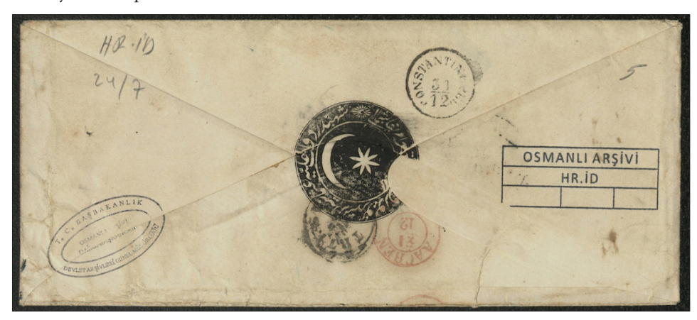
Envelope with seal, "Consulate of the Sublime Ottoman State in the City of New York, North America", 1858, courtesy of Prime Ministry Ottoman Archives.

While in İstanbul I delivered invited lectures at İstanbul University and ARIT on questions of Islamic law and modernity and the Ottoman Empire's relations with Central Asia and the Indian Ocean world.