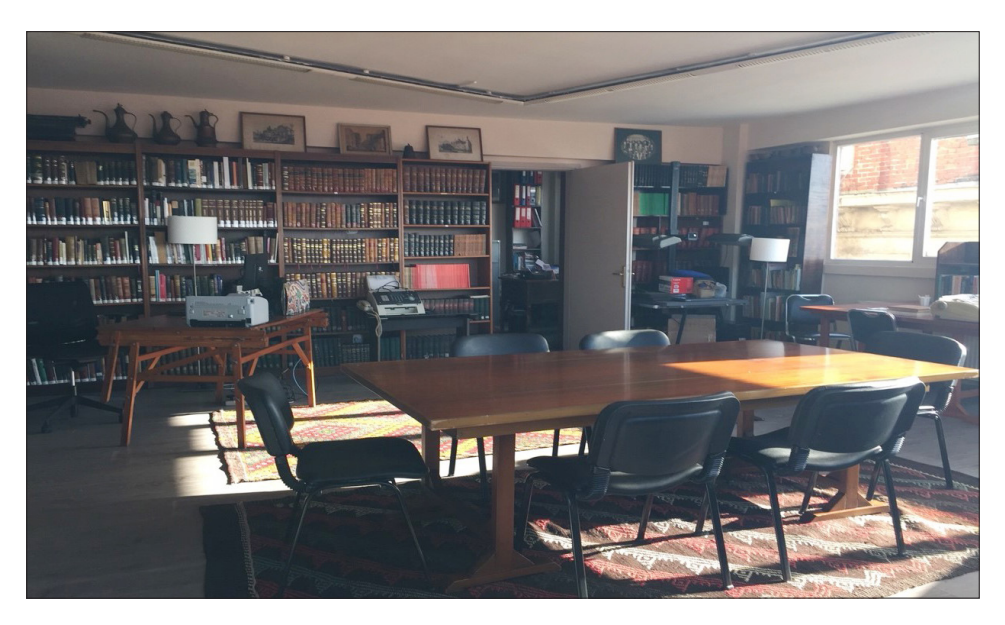
The reading room at Kallavi Sokak.

available for our own fellows and for American scholars in general. While I regret the loss of the hostel, I am hopeful this will be more than counterbalanced by the new possibilities for synergy that the new arrangement will provide. To give one quick example: by moving to ANAMED, we are now being accepted into the Biblio Pera Portal, which provides a single search engine for all the collections of the major research libraries in the city center. This should be an invaluable tool for visiting scholars.