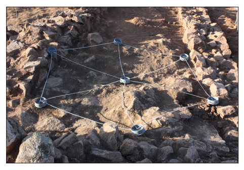
Sampling grid used to recover flotation samples at Kerkenes.